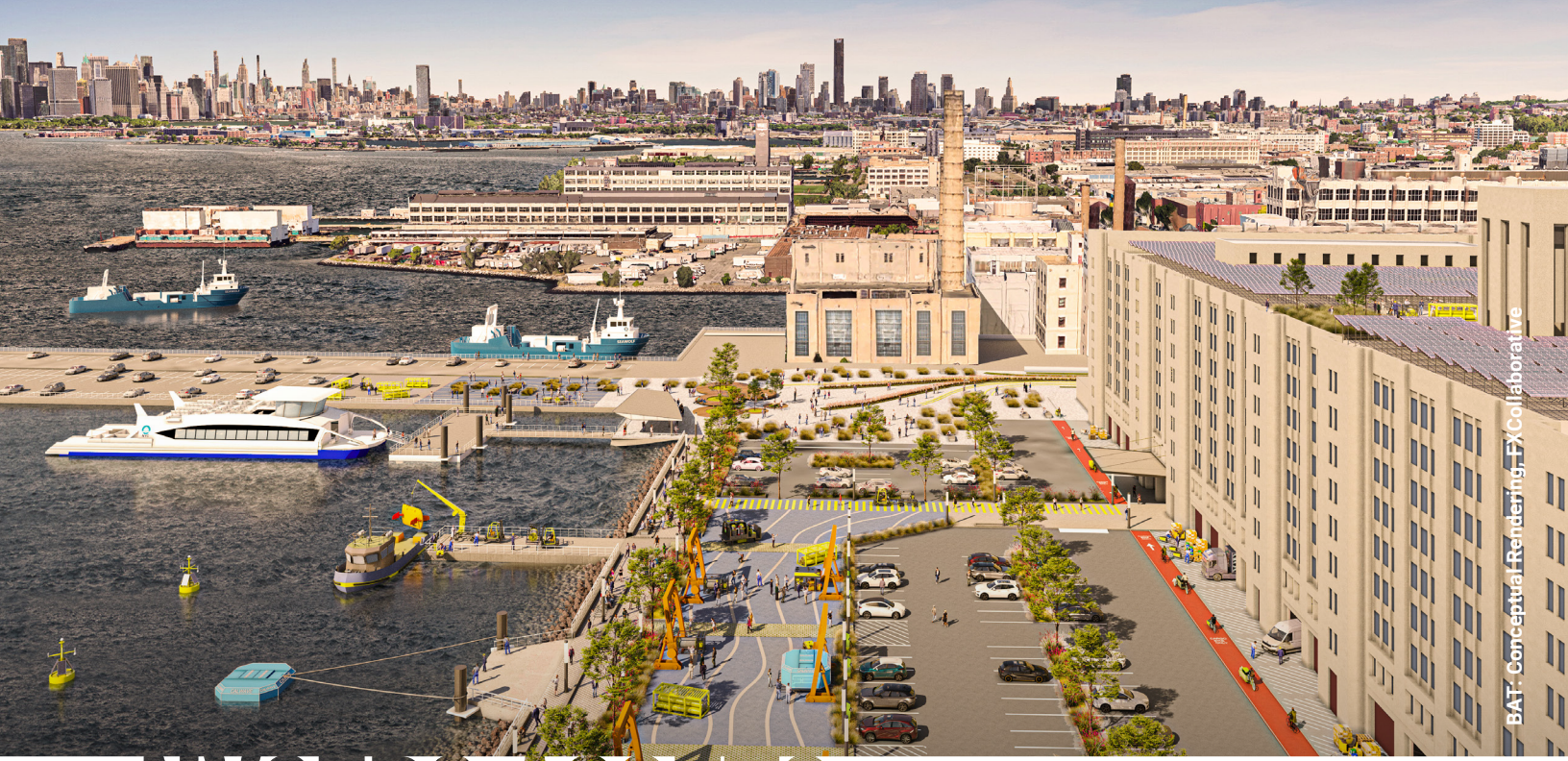
BAT: Conceptual Rendering, FX Collaborative